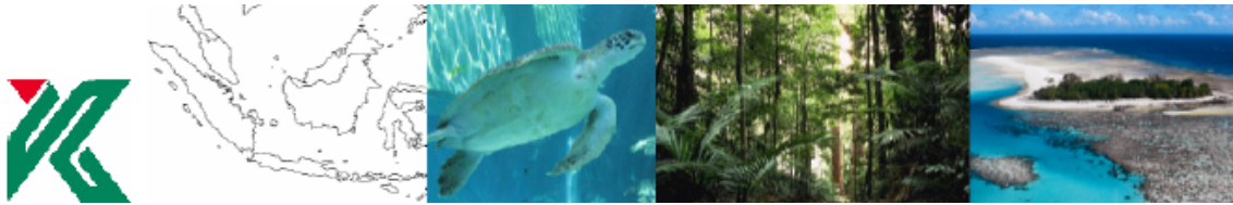
Map of 4 partner Institutions